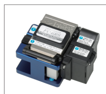
Table-top cleaver FC-6 / FC-6R series