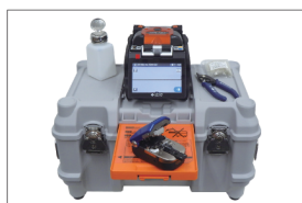
Carrying case with worktable CC-72