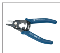
Jacket remover JR-M03