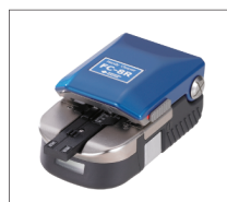
Handy cleaver FC-8R series